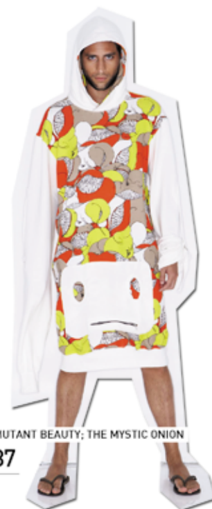
MUTANT BEAUTY; THE MYSTIC UNION