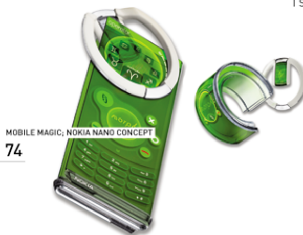
MOBILE MAGIC; NOKIA NANO CONCEPT