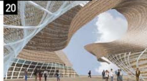
LIFE RAFT; CALLEBAUT'S LILYPAD