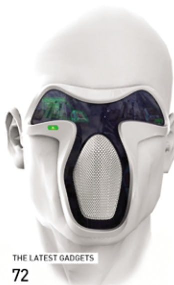
THE LATEST GADGETS