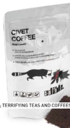
NATURAL SELECTION; TERRIFYING TEAS AND COFFEES